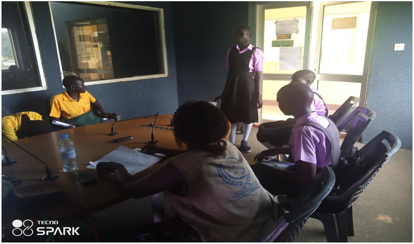
Girls Debate program on local FM radio at Torit town where two primary schools were hosted on the topic "Girl child marriage must be abolished"