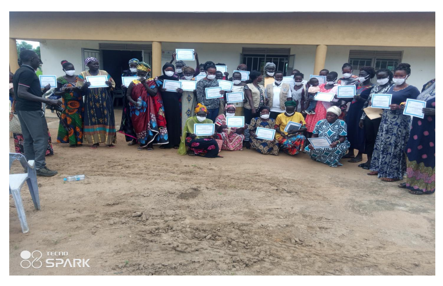
40 Mentor Mothers exposed for group photo after completion of their training in Torit County