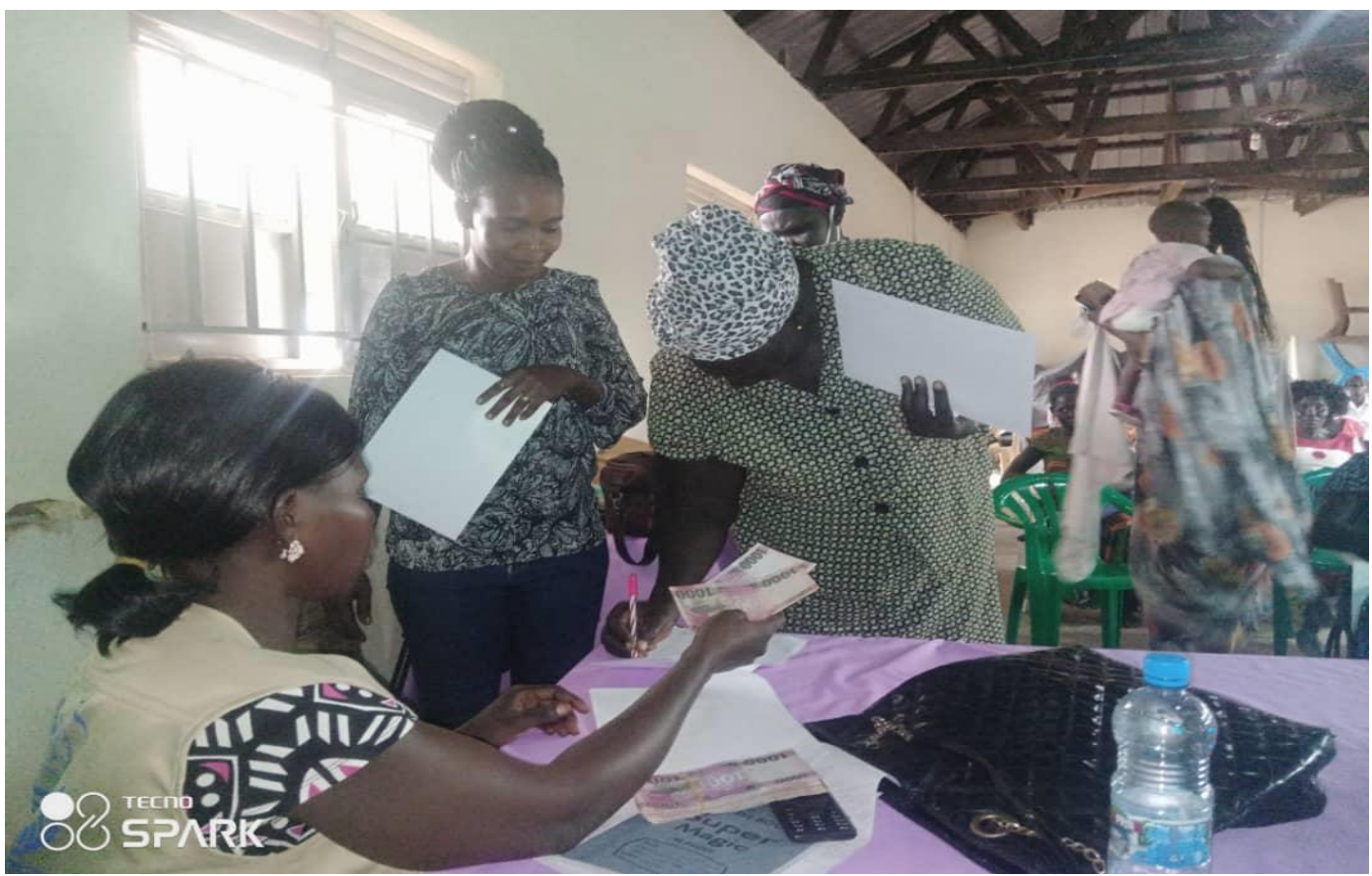
Mentor Mothers Participants signing their transport refund money after completion of their training programs.