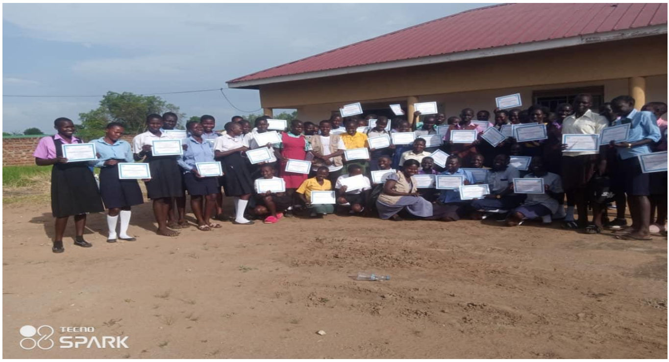
80 schools girls were exposed for group photo after their two days training in Women Centre Torit on SRHR to end early child marriage and pregnancies among schools girls