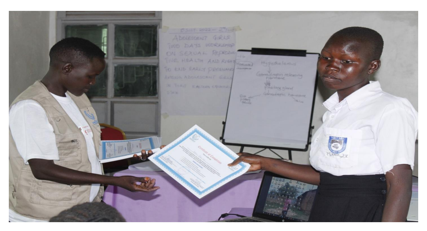
80 school girls participants awarded with certificate of participation after two days training on SRHR to end early child marriages and pregnancies among school girls.