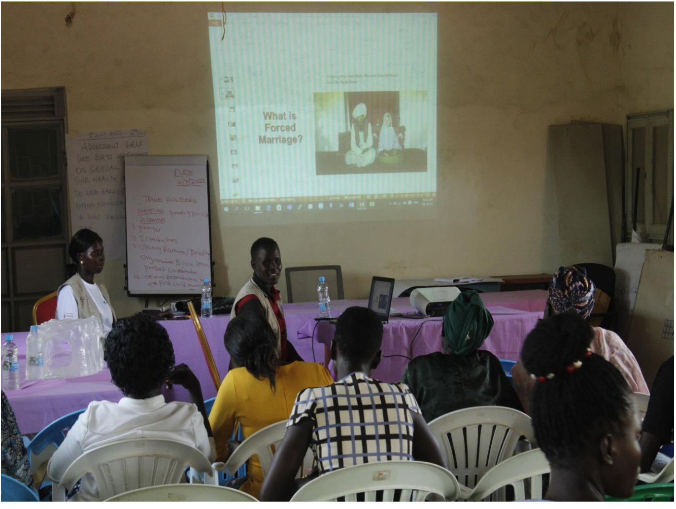
One day stakeholder dialogue meeting in Torit County with 20 women participants